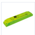
19367 INV P&L LED SE/SA 1H 60-180V