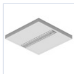
20101 CORNICE PLAF BACKLITE 300X1200