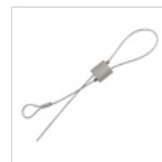
70059 KIT CAVETTO DI SICUREZZA