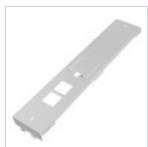
40191 STAFFA ALTA PAN RTI 1200