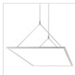
70100 SUSPENSION 4 HOOK PANELED