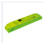
19359 INV P&L LED SE/SA 3H 20-60V