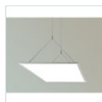
70033 SUSPENSION WIRE PANELED