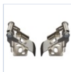
70049 CLIPS UNIVERSALE CGESSO M600