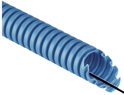
IMMAGINE RAPPRESENTATIVA EC REPRESENTATIVE IMAGE

Conduits and fittings > Conduits > Corrugated conduits > Series icta - pp - class 34223 - 750 n > plastic conduits > Black - cable puller