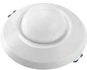
GW 10 595